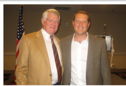
2-time NFL Coach of the Year Dan Reeves is the keynote speaker at a training conference in Atlanta.