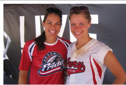
Jessica Mendoza , USA Softball Gold Medalist, takes part in a youth sports event sponsored by an international supplement company.