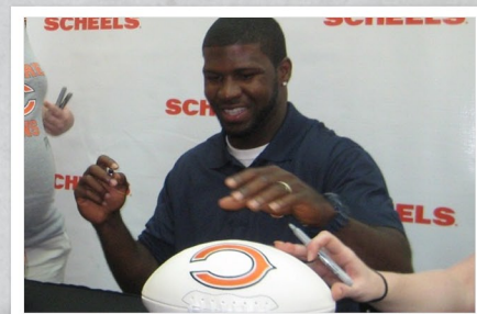
Devin Hester , Pro Bowler and recording-setting kick and punt returner participated at a retail promotion for a sporting goods store in Illinois.