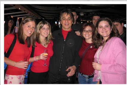
Television star Tony Danza appears at a national convention in California to participate in a booth appearance and VIP receptions.

The following is a partial recap of our event highlights from the past few months: