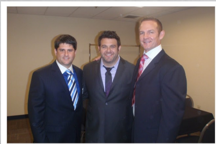
Former NFL running back and ESPN analyst Merrill Hoge participates in meetings and events in Pittsburgh, Pennsylvania.