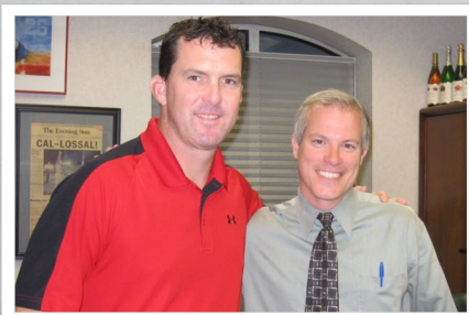
Former Red Sox Outfielder and World Series Champion Trot Nixon throws out the first pitch at a minor league baseball game and signs autographs for fans.