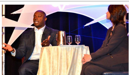
Former All Pro Sterling Sharpe participates in a Q&A and panel discussion during a banquet in Wisconsin.