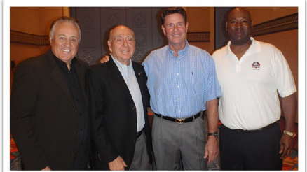
Hall of Famers Jim Palmer and Phil Esposito joined Dick Vitale and Cortez Kennedy at an annual retail conference in Orlando.