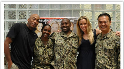
Hollywood Actors Kristanna Loken ( Terminator 3 , Burn Notice ) and James Lesure ( Las Vegas , Men at Work ) visited military personnel stationed in the Middle East on a goodwill tour.