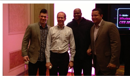
Former Chicago White Sox and 2-time AL MVP Frank Thomas , along with NL Rookie of the year Bryce Harper and Triple Crown winner Miguel Cabrera appeared at a partnership event with the MLB in Las Vegas.