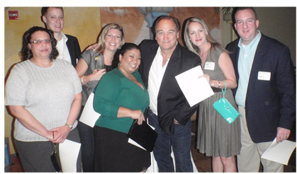
Television star Jim Belushi appeared at a national convention in Florida to participate in a booth appearance and VIP receptions.

The following is a partial recap of event highlights from the past few months: