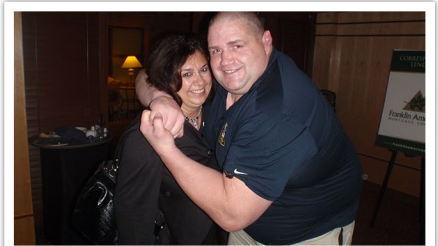
Olympic Gold Medalist Rulon Gardner was the keynote speaker at a sales meeting in Denver.