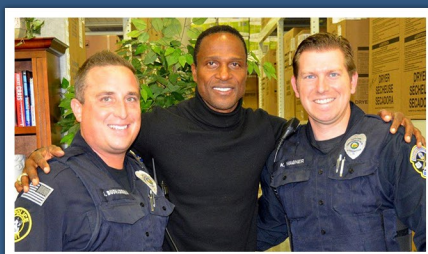
Former Chicago Bear and Olympic athlete Willie Gault signs autographs for Bears fans in Chicago for a retail grand opening.