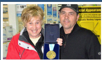
Neal Broten , member of the 1980 Miracle on Ice USA Team and Hockey Hall of Fame, participated in a retail promotion where he signed autographs and posed for photos with fans in Minnesota.

The following is a partial recap of event highlights from the past few months: