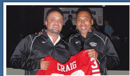
Roger Craig , 3-Time Super Bowl Champion and 1988 NFL Offensive Player of the Year, participates in a panel discussion at a scholarship fundraiser.