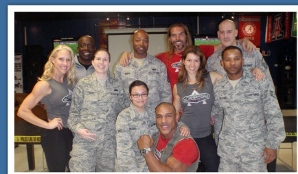
Tae-Bo creator Billy Blanks and American Gladiators Wolf, Venom, Militia and Phoenix participated in a series of training clinics and competitions with US troops serving in the Middle East.