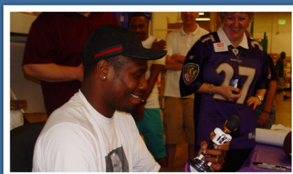
NFL Pro Bowler Jacoby Jones participated in a meet & greet where he signed autographs and posed for photos with Ravens faithful in Baltimore.