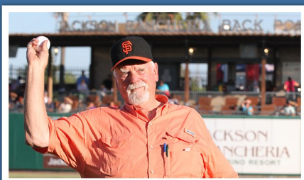
Baseball Hall of Famer Gaylord Perry attended a minor league game where he signed autographs and threw out the first pitch.