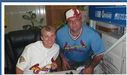
World Series MVP David Eckstein signed autographs for fans at a store grand opening in Missouri.