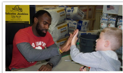
Super Bowl Champion and former Ohio State Buckeye star FS Malcolm Jenkins participated in a meet & greet with Buckeyes fans in Ohio.