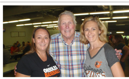
Brooks Robinson , former Baltimore Orioles third baseman and Baseball Hall of Fame member, participated in a corporate outing where he greeted employees and signed autographs.