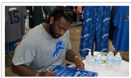
Detroit Lions TE and former first round pick Brandon Pettigrew participated in an autograph event in Michigan where he signed autographs and posed for photos with Lions fans.