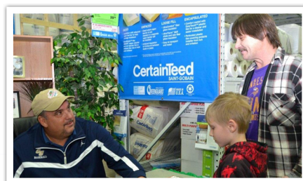
Kent Hrbek , Minnesota Twins great and 2-time World Series Champion, participated in a retail promotion where he signed autographs and posed for photos with fans in Minnesota.