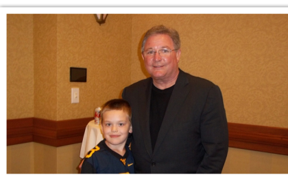
Akron University head football coach Terry Bowden delivered a keynote speech at an annual fundraiser in West Virginia.