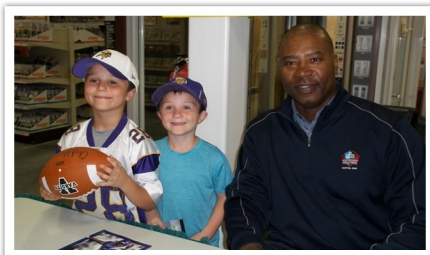
2014 NFL Hall of Fame Inductee and Minnesota Vikings legend CHRIS DOLEMAN participated in a retail grand opening where he signed autographs and posed for photos with fans.