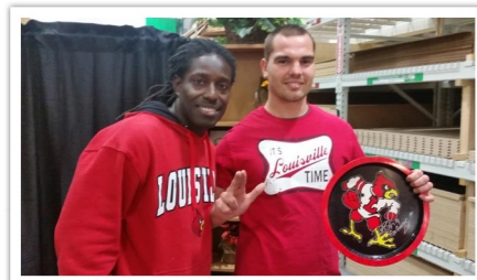
Super Bowl MVP and two-time Super Bowl champion DEION BRANCH participated in a retail promotion where he signed autographs and posed for photos with fans in Indiana.