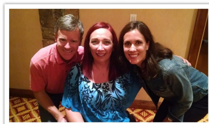
AMY VAN DYKEN , six-time Olympic Gold Medalist, delivered an inspirational keynote speech at an employee conference in Colorado.