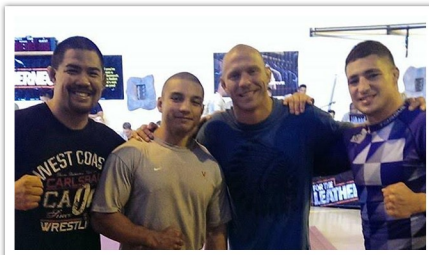
UFC Fighters MARK MUNOZ , DONALD "COWBOY" CERRONE and DIEGO SANCHEZ held an MMA Clinic and watched the fights with Marines stationed in California.