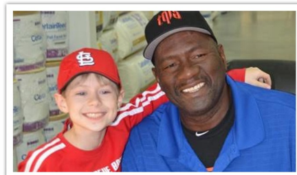
Former St. Louis Cardinal and Chicago Cubs relief pitcher LEE SMITH participated in an autograph appearance at a retail chain in the midwest.