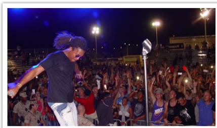
Hip Hop superstar LUPE FIASCO performed a series of concerts for military personnel in California which also featured renowned stand up comedian and actor DERAY DAVIS .