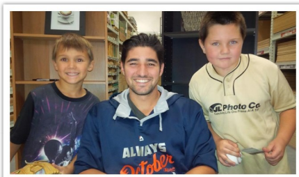
NICK CASTELLANOS , current Detroit Tigers third baseman, attended a meet and greet event with Tigers fans in Detroit.