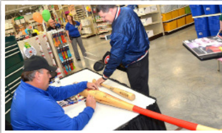
KENT HRBEK , Minnesota Twins legend, participated in a retail grand opening where he signed autographs and posed for photos with Twins fans in Minnesota.