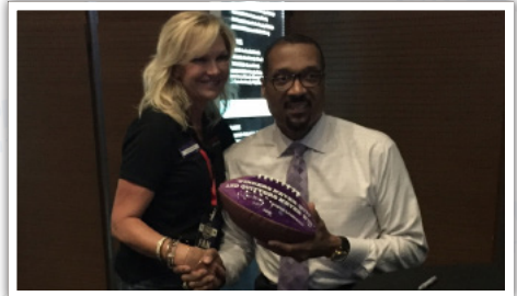
ESPN College Football Analyst and College Football Hall of Fame member MARK MAY attended a corporate banquet at the College Football Hall of Fame in Atlanta, GA.