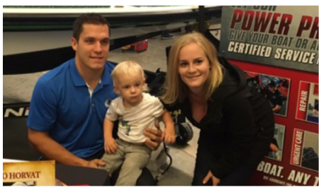
BO HORVAT , Center for the Vancouver Canucks, signed autographs and posed for photos with Canucks fans in Vancouver.

The following is a partial recap of event highlights from the past few months: