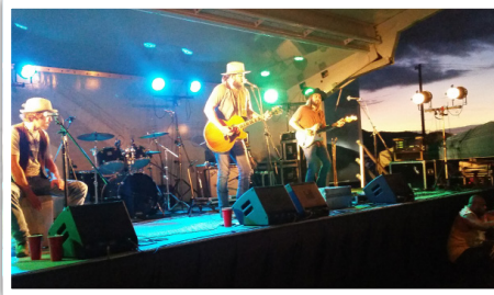
Country music group THE SCOOTER BROWN BAND performed for military personnel at an annual music festival in the Pacific Rim.