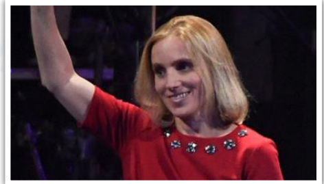
Iconic Olympic Gold Medalist KERRI STRUG participated in a corporate retreat in New York.