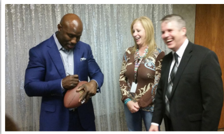
Super Bowl MVP and NFL MVP TERRELL DAVIS delivered a motivational keynote speech at a youth fundraiser in Colorado.