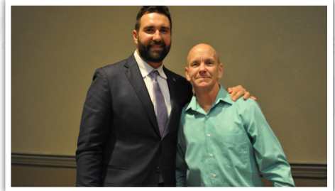
New England Patriots Super Bowl champion ROB NINKOVICH was the featured keynote speaker at a fundraiser in New England.