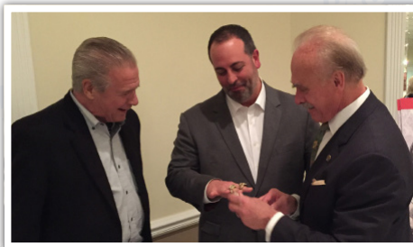
4-time Super Bowl Champion and war hero ROCKY BLEIER was the featured guest and keynote speaker at a special event for a Veterans Commission in the Chicago area.