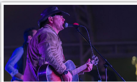
Country music artist KEITH ANDERSON was the headlining entertainer on a goodwill military tour to perform for troops stationed in southwest Asia.