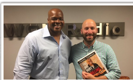
FRANK THOMAS , Baseball Hall of Famer and member of the 500 Home Run Club, was the featured Q&A guest at a corporate reception in Illinois.