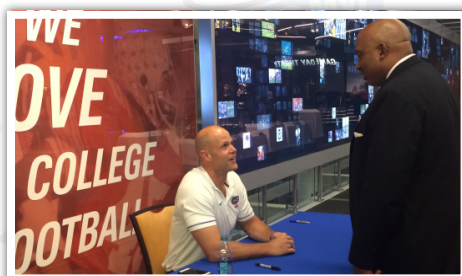
Heisman Trophy winner and College Football Hall of Fame member DANNY WUERFFEL was the featured guest at a corporate reception in Atlanta.

The following is a partial recap of event highlights from the past few months: