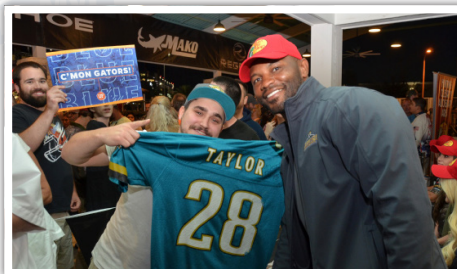
Former NFL Pro Bowl RB FRED TAYLOR participated in a ribbon-cutting ceremony and autograph session at a retail grand opening in Florida.