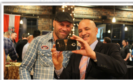
UFC Hall of Famer RANDY COUTURE attended an employee reward event where he participated in an intimate meet and greet and Q&A.