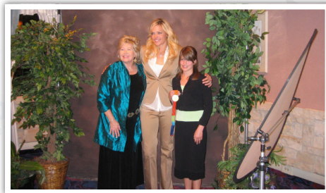
Olympic Gold Medalist JENNIE FINCH attended a retail appearance where she signed autographs and posed for photos with customers.