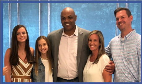
NBA Legend, and Emmy Award-winning television host CHARLES BARKLEY was the featured speaker at a youth fundraising dinner in Tennessee.

The following is a partial recap of event highlights from the past few months: