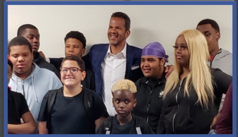
ANDRE REED , Former Buffalo Bill Pro Bowler and 2014 Pro Football Hall of Fame inductee, gave an inspiring keynote at a youth event in New Jersey.