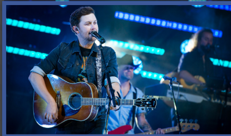
Pro Sports MVP teamed up with acclaimed country music artist SCOTTY McCREERY for an electrifying concert in California, organized in honor of military personnel and their families.