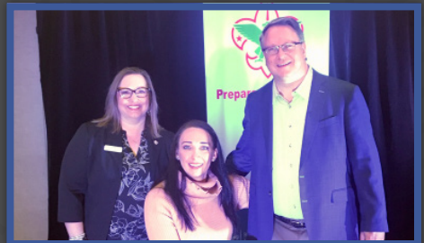
Six-time Olympic Gold medal swimmer and motivational speaker AMY VAN DYKEN provided an encouraging keynote speech at a client's leadership breakfast in Colorado.