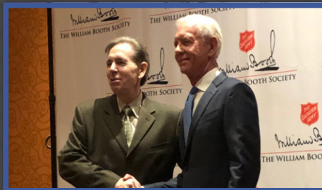
CAPTAIN CHESLEY "SULLY" SULLENBERGER , the pilot who was at the helm during the Miracle on the Hudson, was the guest speaker in Oklahoma at a fundraising event.