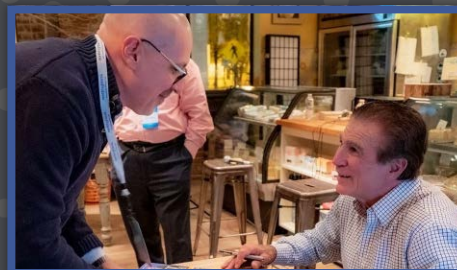
Former Philadelphia Eagles wide receiver, VINCE PAPALE , whose story inspired the 2006 film "Invincible," was a featured guest at a private client reception in Philadelphia.