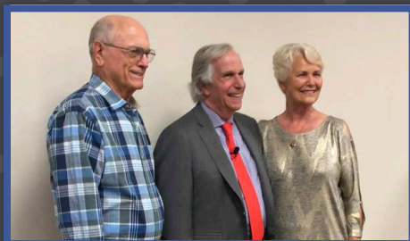
HENRY WINKLER , American Icon known for his role of "Fonzie" on Happy Days and his Emmy-award winning portrayal of Gene Cousineau on HBO's Barry, participated in a VIP photo session and gave a rousing keynote at an annual fundraiser in Georgia.