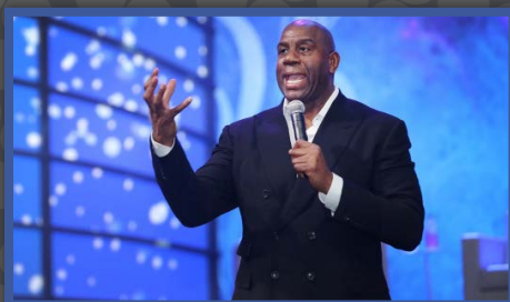
NBA Superstar and 5-time World Champion MAGIC JOHNSON delivered an electrifying keynote at an international conference in California.

dchavez@prosportsmvp.com cell (719) 440-3372