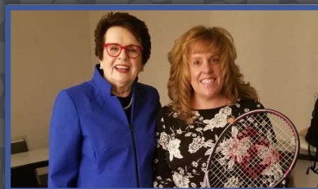
The iconic BILLIE JEAN KING , longtime champion for social change and equality, provided a memorable experience for the attendees at a sales conference.