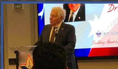
Former Secretary of Education, celebrated author, and political television/podcast host BILL BENNETT was the headlining speaker at a fundraising breakfast in New Jersey.