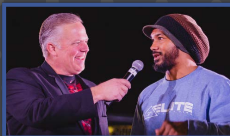
Former UFC Lightweight Champion and current Bellator MMA Fighter BENSON HENDERSON was a special guest at our MMA Fight Night Live show in California.