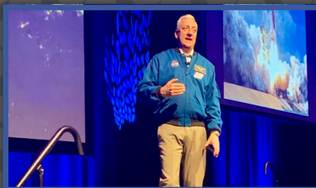
Former NASA Astronaut and frequent guest on the CBS hit series Big Bang Theory, MIKE MASSIMINO , gave a keynote at an awards banquet in Idaho.